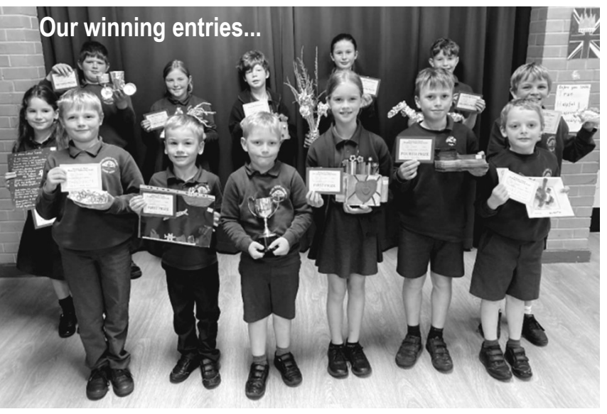
Enjoying the Brailsford & District Ploughing Match and retaining the Perpetual School Trophy.